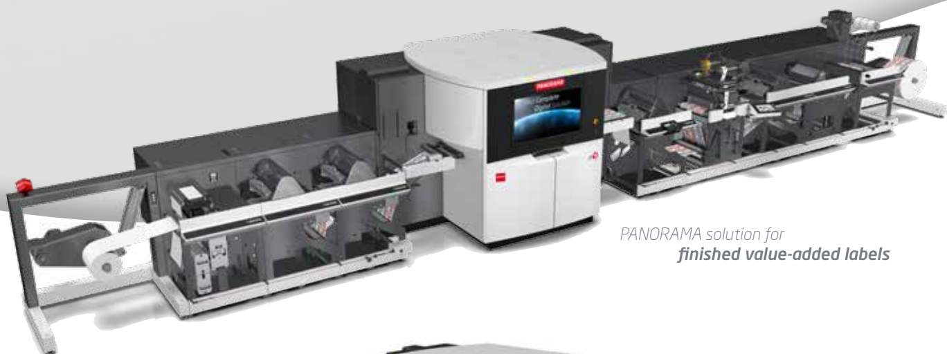
PANORAMA solution for finished value-added labels